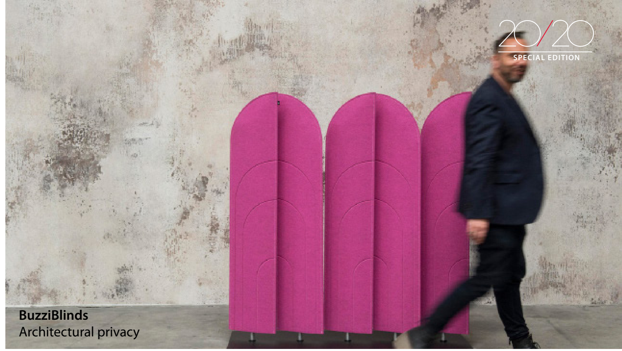
BuzziBlinds Architectural privacy