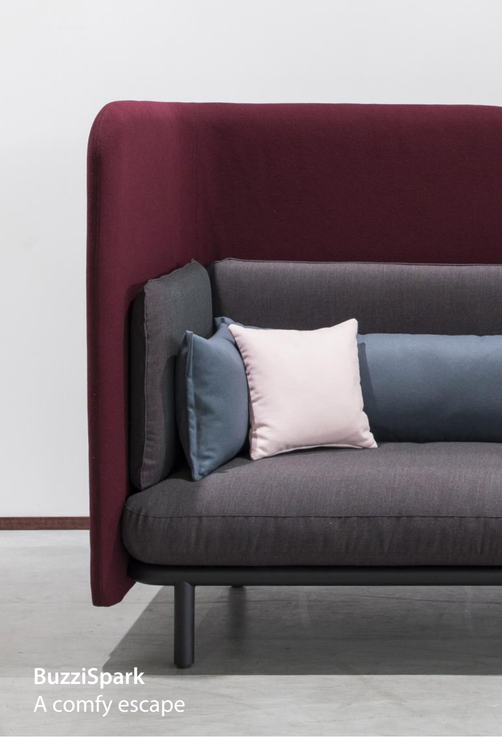
BuzziSpark A comfy escape