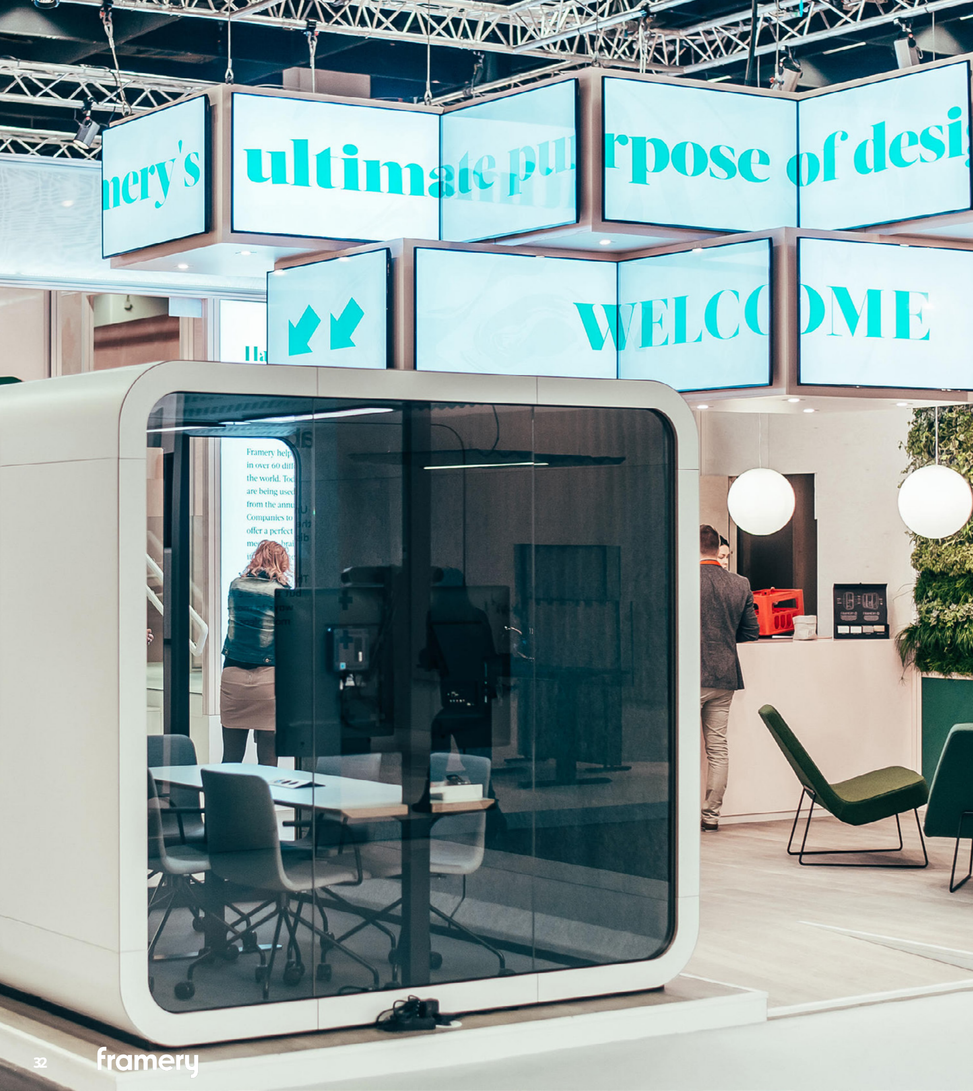
Framery 2Q Double your efficiency, meet the 2Q