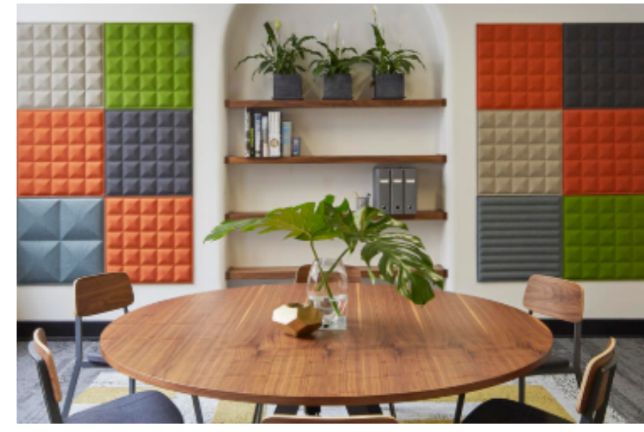
BuzziTile Mix & match colors and patterns